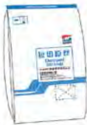
Composite plastic woven bags