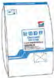
Composite plastic woven bags