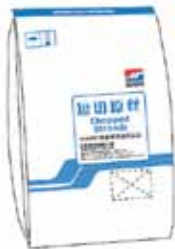
Composite plastic woven bags